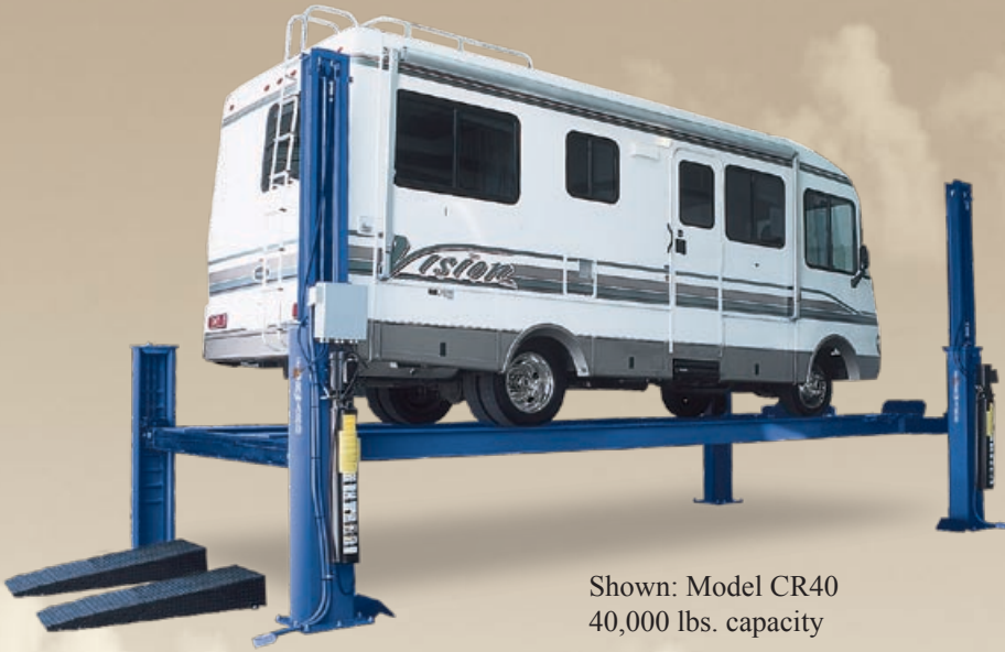
Shown: Model CR40 40,000 lbs. capacity