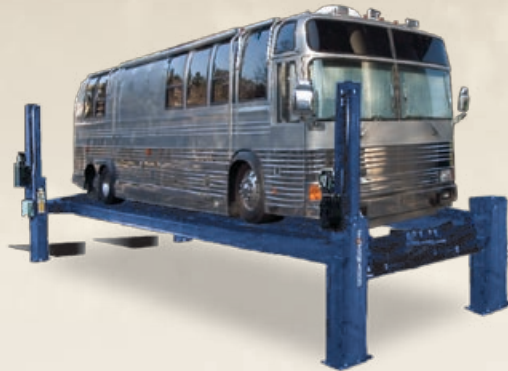
Shown: Model CR60 60,000 lbs. capacity