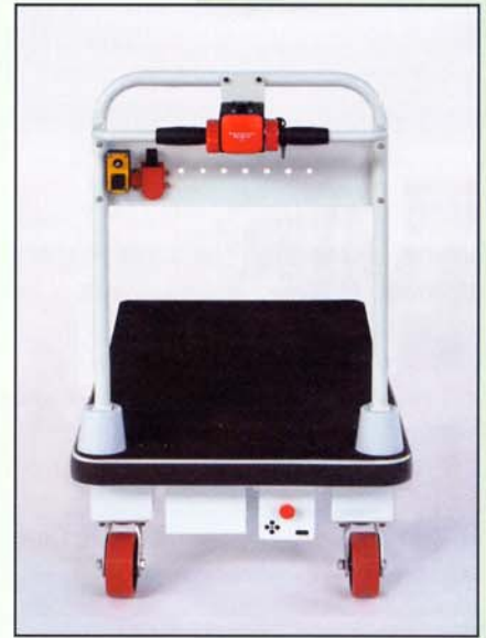
End View of Moto-Cart Jr.

The Moto-Cart Jr. is an economical solution to electric cart applications. Designed as a more basic model than the standard Moto-Cart, this cart still offers transaxle drive and advanced roller grip controls. The 4-Wheel Jr. comes in one popular size and has a 1,100 lb capacity. The maintenance free batteries are rechargeable with an on board charger that runs on standard 115 voltage. Also available is the tote rack assembly. It can carry two large totes (optional) with each opening measuring 18 3/8" W x 21.5" L x 7.5" D, there is also an additional area on the lower platform for large parcels.