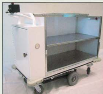
Custom Order Picking Carts Cart features flip up middle shelf for easy access to lower shelf.