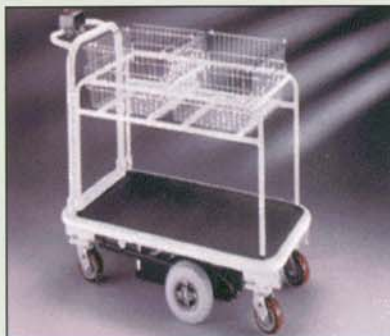
Mail Room Carts Cart features removable Mailroom Rack and Basket Assembly (only available on MC-10-S)