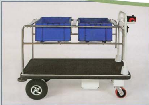
Moto-Cart Jr. Tote Rack