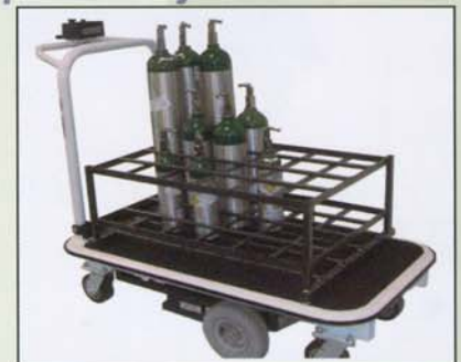
Moto-Cart with Optional Oxygen Cylinder Rack Top holds 28 C, D or E size cylinders. Polyethylene coated to protect cylinders and prevent noise. Designed as an option to our standard MC-10-S unit.