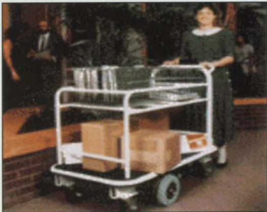
Office Deliveries shown with mail room basket assembly

The Moto-Cart is a battery operated self-propelled electric platform truck. It can be used almost anywhere equipment and supplies have to be moved. This unique cart increases productivity and reduces injuries caused by pushing and pulling ordinary non-powered carts. This flexible vehicle can travel over carpeting, tile or any hard surface, go in and out of elevators and handle 1,000 lbs. on inclines up to 6 degrees.