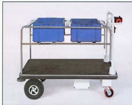
Optional Tote Rack Assembly