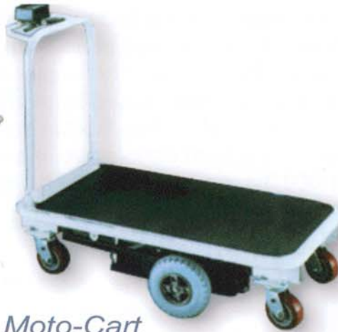
Moto-Cart Self Propelled Electric Cart