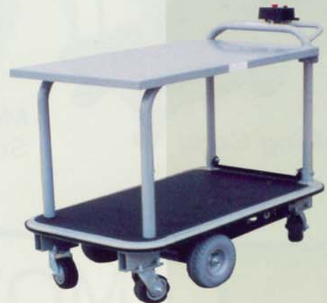
Cart with Top Shelf