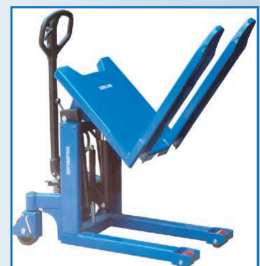
Portable Tilt & Lift Tables