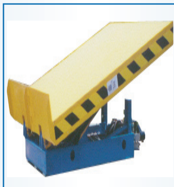
Tilt Tables Lift & Tilt Tables